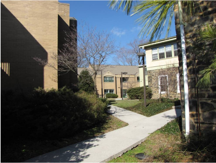
View from southwest of the circa 1994 non-contributing dormitory and its proximity to the historic dormitory and addition.