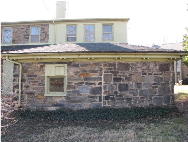
Ancillary stone outbuilding constructed in 2 stages (note the different coursework and cut of the stone.)