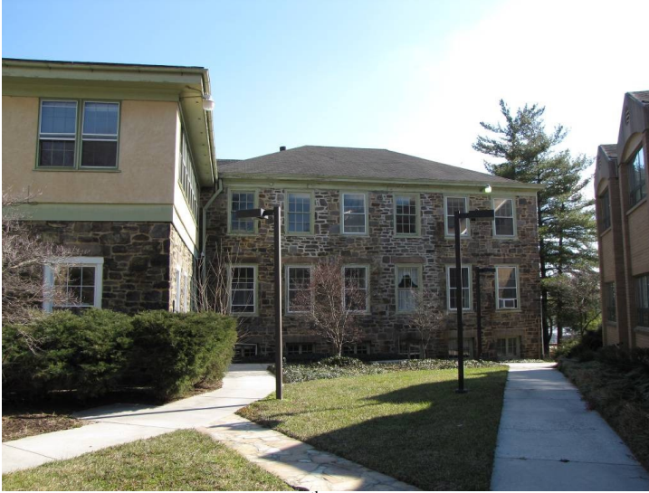
View from north of the early 20 th century dormitory, and adjacent rear addition.