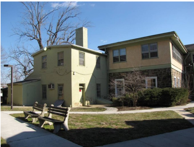
View from north of the rear additions, dating to different construction stages in the 19 th and 20 th centuries.