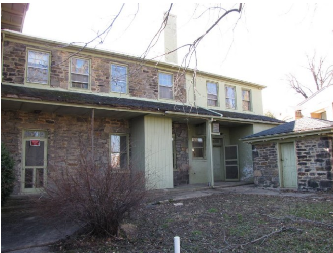
View from east of the rear additions to the stone mansion, constructed of stone and brick. Late 19 th century maps depict rear additions to the stone mansion.