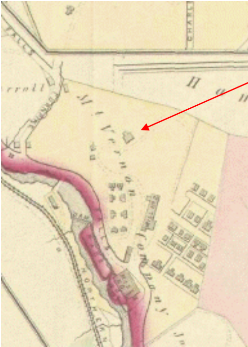
1876 map of the Mount Vernon Company. In City Atlas of Baltimore, Maryland and Environs (Philadelphia: G.M. Hopkins, 1876), Vol. 1, Plate R, pg. 68-69.