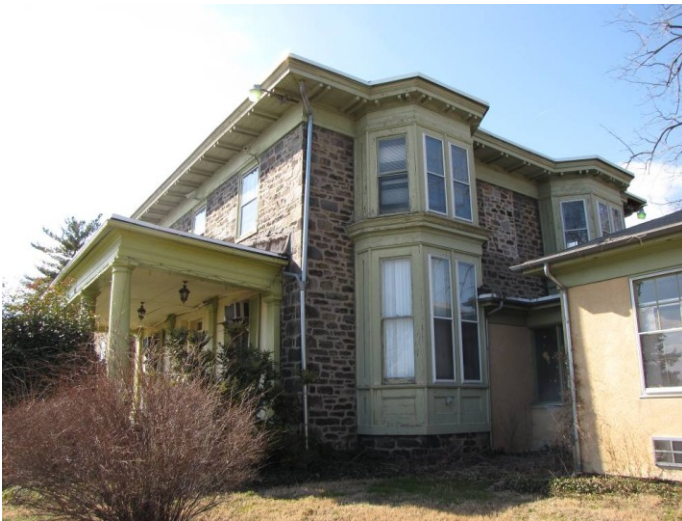
Side view of the original stone mansion showing alterations to the building.