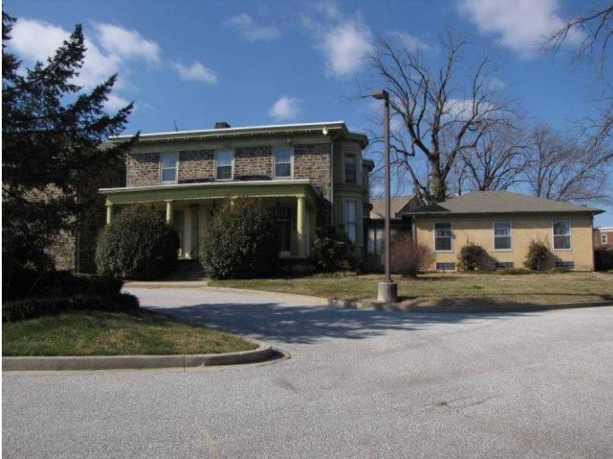
View of the original house and a circa 1994 non-contributing one story addition.