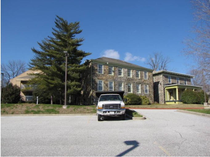
View of the non-contributing circa 1994 dormitory to the left, the early-20 th century stone dormitory addition and the original house.